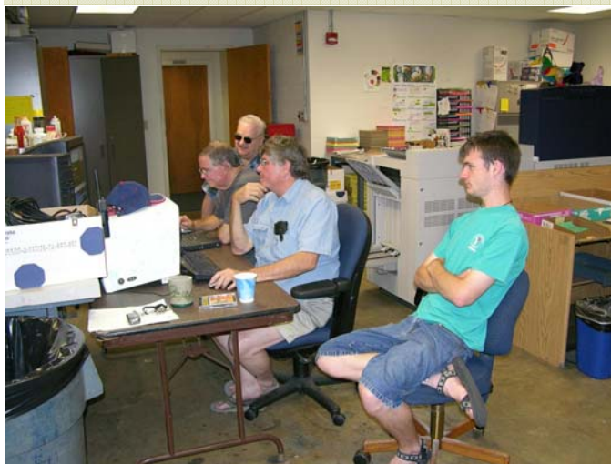
The PSK Crew