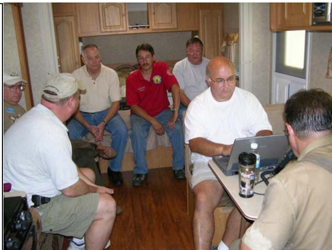
The 80 meter SSB crew