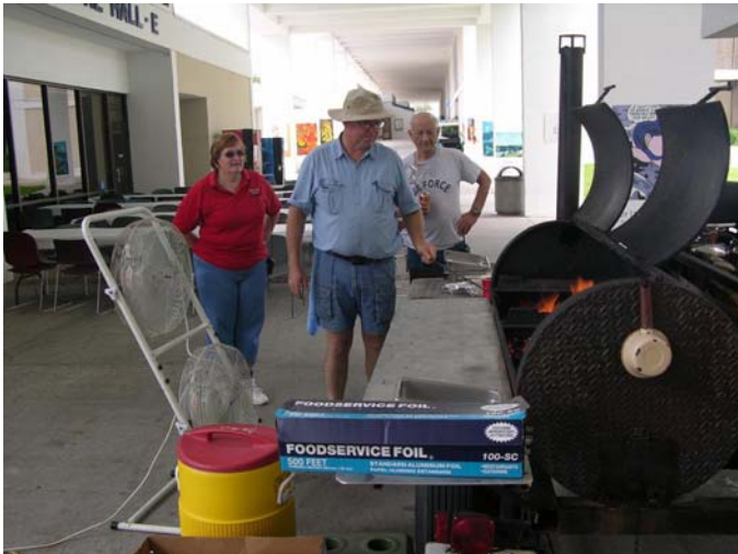
Let's Hear it For the Cooks