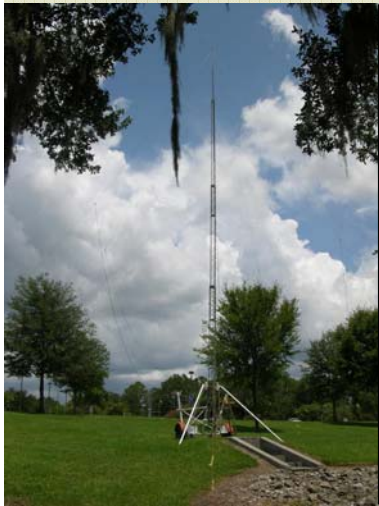
Low-band Wire Pile Antenna