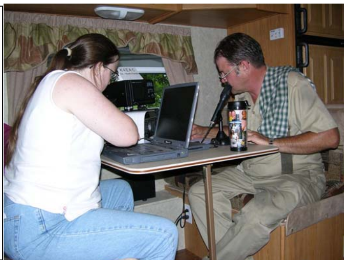
K4GLM and K14CVS on 80 meter SSB